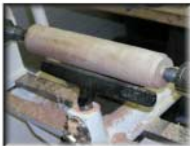
Turn a tenon for jaws