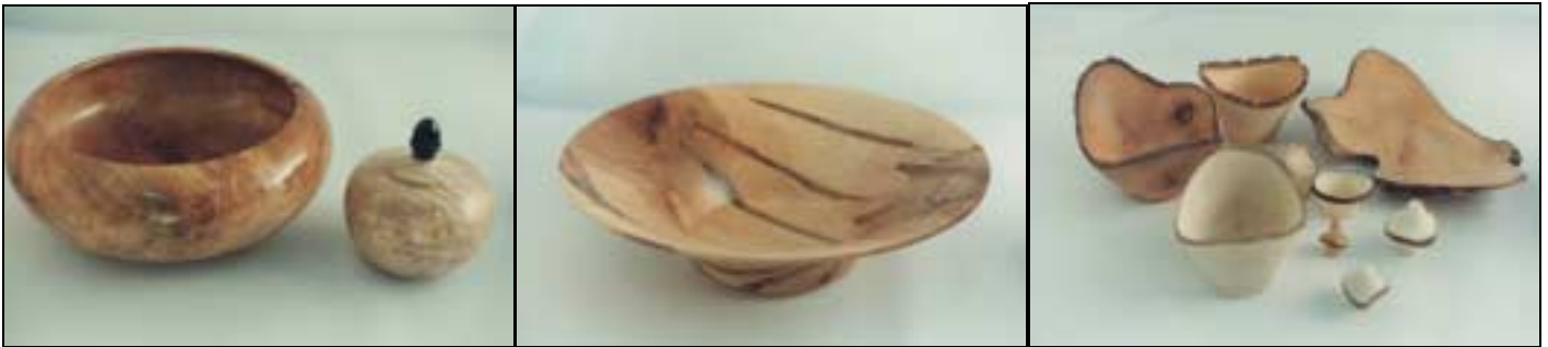
Left: Don Riggs a 10"W X 4"H Ambrosia Maple bowl and a 3"W X 3"H Maple lidded box with Ebony finial. Center: John Trant 12"W X 4"H Ambrosia Maple bowl. Right Bob Grudberg 5 Tagua Nut mushrooms, two Dogwood natural-edge bowls and two steep sided Bradford Pear natural-edge bowls