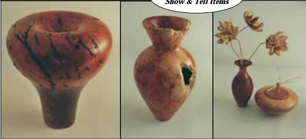
Left: Alan Becker 9"W X 7"H red Gum burl and Walnut hollow form Center: Alan Becker 9"H X 5"W Red Mallee Right: Neil Kagan 7"H Mahogany beaded bud vase; with dried lilies and a Cherry lidded container with a bamboo sprig