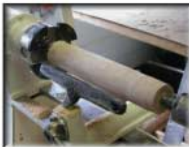
Mount in Jaws