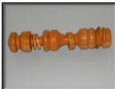
Finish One of a kind