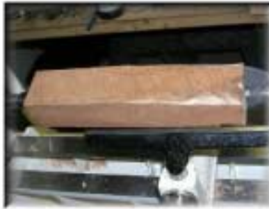
Mount between centers