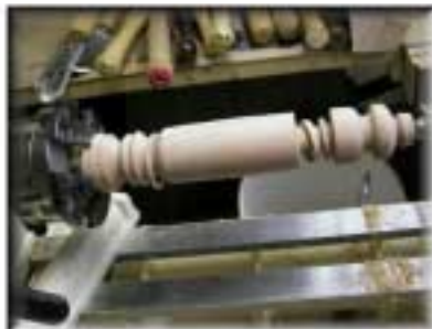
Remove wood leaving ring