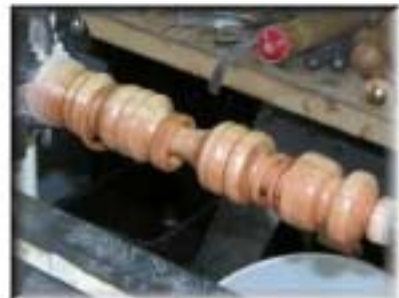
Define ends begin finish