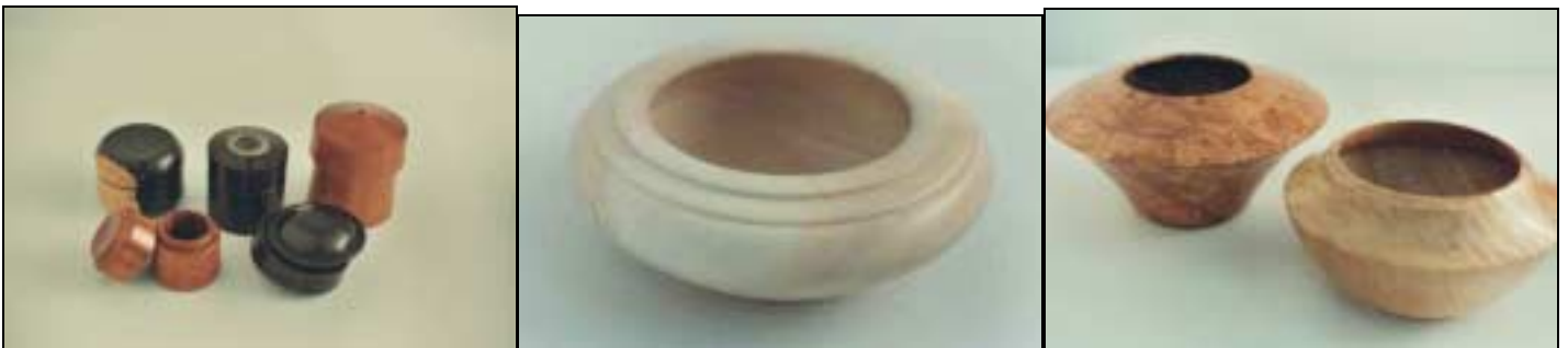
Left: 5 lidded boxes of various exotics each with a threaded lid. Center: Charles "Zeke" Miller a 6"W X 2"H Royal Pawlonia bowl. Right: John Trant a 10"W X 4"H Maple burl hollow form and a 8"W X 3"H Maple bowl