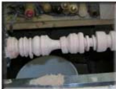
Complete unique shape