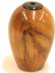
Andy Blackwell, 4 1/2 x 3 Cherry form with cocobolo collar

This is a reminder that in order for your piece to appear in this section of the newsletter, at some point during the monthly meeting, you will need to bring your piece to Don so it can be photographed.