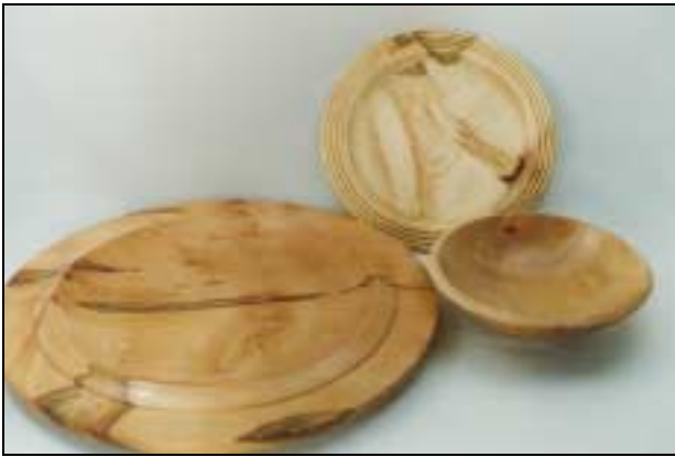
Left: Don Riggs - 13"W Ambrosia Maple bowl, a 5" W cherry bowl; and a 6" W Maple bowl