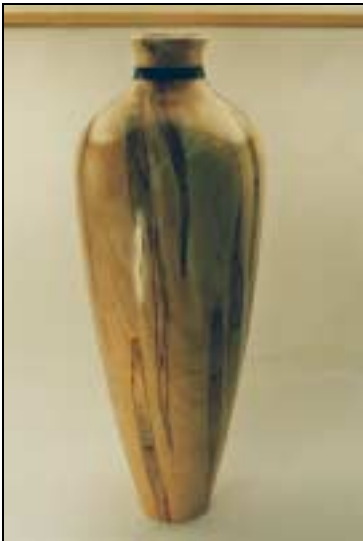
Left: Alan Becker - 24"H Ambrosia Maple vase with a walnut accent ring.