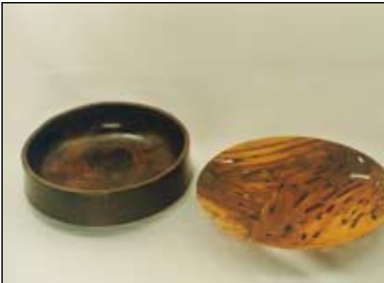
Left: Bob Lancaster - a 7"W Wormy Apple bowl and a 6" Black Walnut bowl. Right: Don Riggs - a 3"W Peach bowl; a 4"WQ Dogwood bowl; two natural edged items of Dogwood (5"W) and Maple (6"W); and a 10" platter of Black Walnut from Illinois