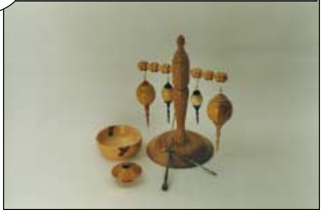
Right: Don Hart -A small Hawthorne bowl; and a 6" miniature ornament tree