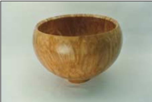
Left: Steve Bishop - 5"h and 6"W Big Leaf Maple