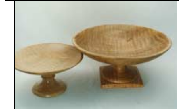
Right: Don Riggs - two Maple pedestal bowls.