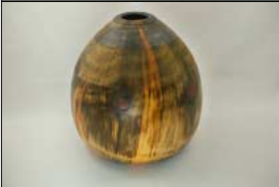
Left: Chris Light - an end-grain turned Norfolk Pine hollow form