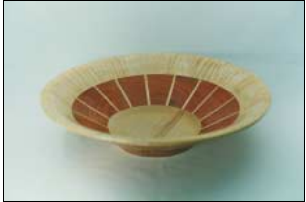
Right: Another segmented bowl of Maple and Redheart