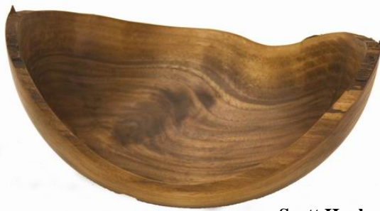
Scott Hurley, 9" natural edge walnut bowl And 8" hollow Bradford Pear & Tulipwood