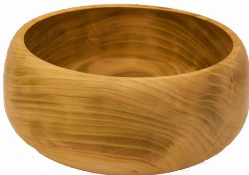
Bob Horowitz, 13" x 5 1/2" cherry salad bowl