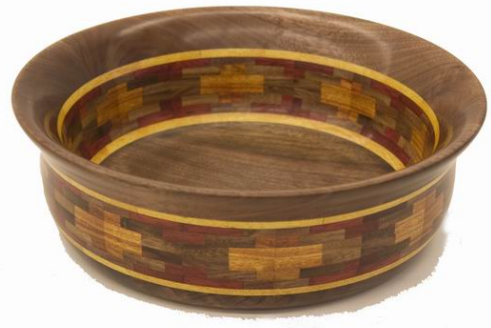
Gene Crosby, 13" segmented bowl of various woods