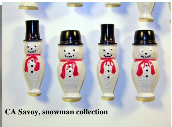
CA Savoy, snowman collection