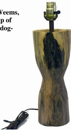
Henri Weems, 12" lamp of spalted dog- wood