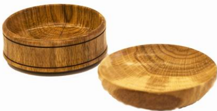
John Overman, Bowls in Contrast , pin oak 4 1/2"