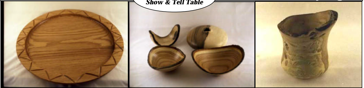
Above left: Richard Allen - 16"W Red Oak platter. Center: Don Riggs - two natural edged Peach bowls, one Oak natural edge wing-bowl, and one Ash 6"W hollow form Above right, Paul Burke - 2"H natural edge