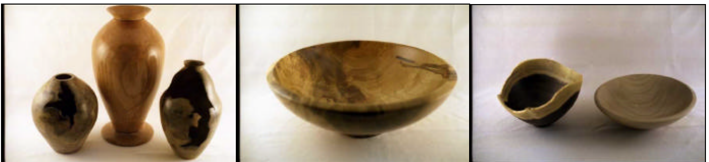
Above left: C.A. Savoy - 12"H Asian elm vase and two Poplar Burl HF with voids all made with laser-guided boring bar as demonstrated at the January meeting. Center: Don Riggs - 14"W X 5"H Maple bowl. Above right: Don Riggs - a 3"W X 3"H Walnut NE and an Ash 4"W bowl