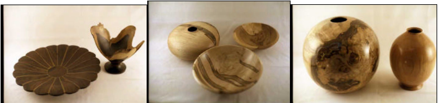
Above left: Dean Swagert - 10"W Ziricote Segmented platter and a 6"W natural edge African Blackwood. Center: Don Riggs - two Ambrosia Maple pieces - one 5"W hollow form and one 6"W bowl; also a 4"W Apple-crotch bowl. Above right: C.A Savoy - 7"H round Maple Burl hollow form and a 6"H Asian Elm elipse hollow form