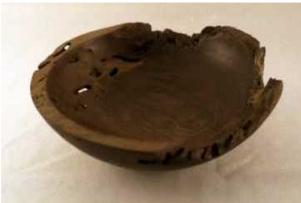
Left: Val Spring - 4"W wormy Walnut natural edge bowl.