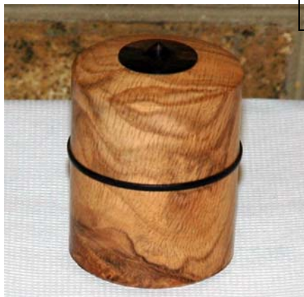
▼ Grab Bag Winners →