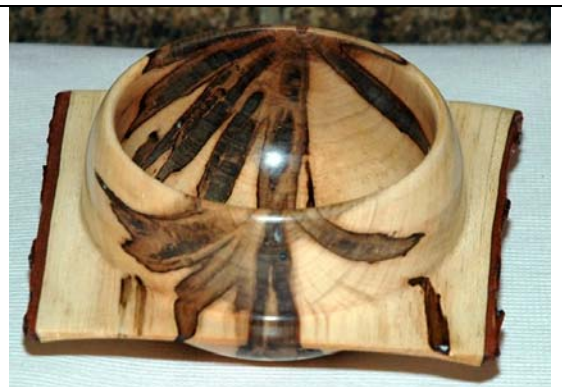
CAW Holiday Party