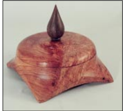
Left : Mike Parker - Mike's 2 nd turned item - a 5"H X 3"W Mahogany box with a fitted lid. Center: Dean Swagert - A 10W X 5"H Yews hollow-form. Right: Elliot Feldman - a 6"W X 2"H Afzalin burl lidded box