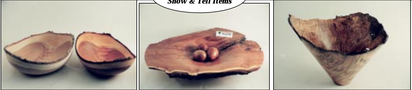
Left: Bill Hardy - two natural-edged Cherry bowls, both approximately 10"W X 6"H, one finished and one unfinished Center: Tom Boley - "The nest of the rare Mesquite eagle" 20"W X 4"H . Right: Phil Brown - a 12"W X 10"H spalted and wormy Curly Maple funnel shaped vase