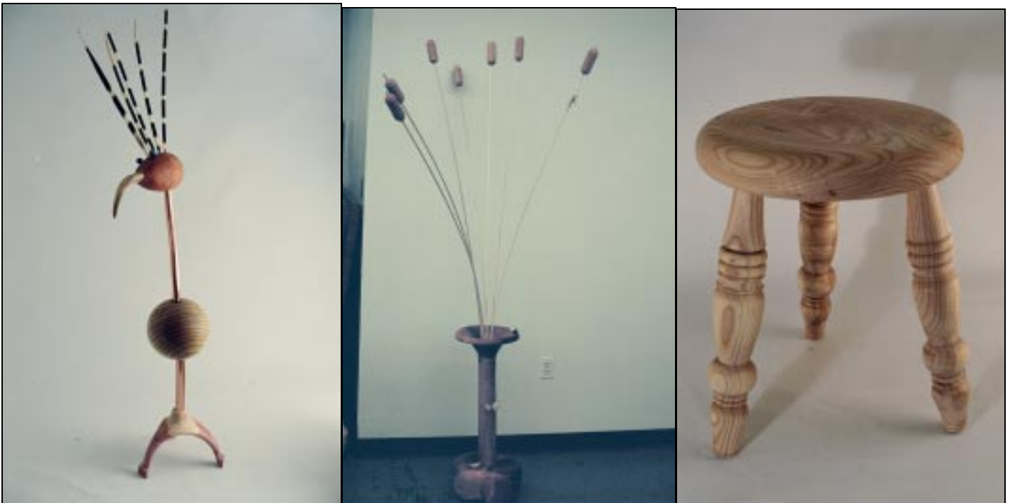
Left: Frank Stephanski - a 22"H X 4"W stylized bird with copper tubing, Cedar, Maple, Lacewood, and porcupine quills Center: Unknown - an 8 foot high mobile made of dowel-wood with Oak willow-tops and an Oak base with a Maple central stand including butterflies. Right : Greg Downs - an Ash three-legged stool 14"H X 10"W