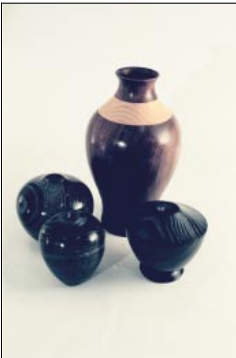
Left: Don Riggs - a Walnut vase with a Maple top ring, and three Maple hollow forms that have been ebonized and lyme waxed for contrast.. Center-below: John Trant - a 3"H Mahogany lidded box. Right-below: Joyce Beene - a natural-edged bowl of 6"W X 3"H Maple with wood burning surface treatments and carvings