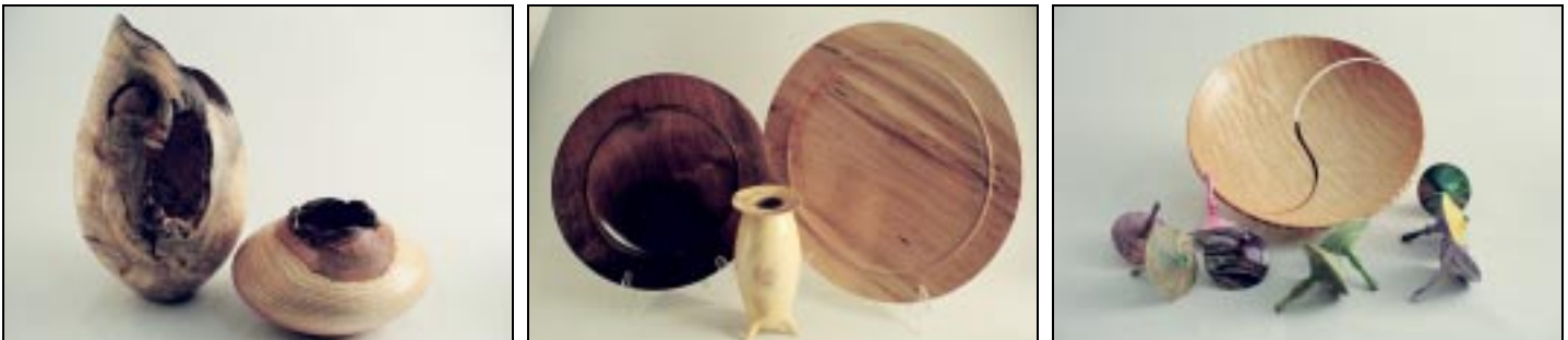
Left: Doug Pearson - a 6"W X 4"H Oak natural-edged hollow form and a 12"H X 6"W Spalted Maple Natural-edged hollow form. Center: Patrick O'Brien - 12"W X 1"H Walnut platter, another 15" W Maple platter and a 8"H Grapefruit vase with a carved footed-base. Right Don Johnson - 8"W X 1"H Tiger Maple dish band sawed and re-mounted aon a base, and nine marbleized tops with cavechon inserts on the spinning tin