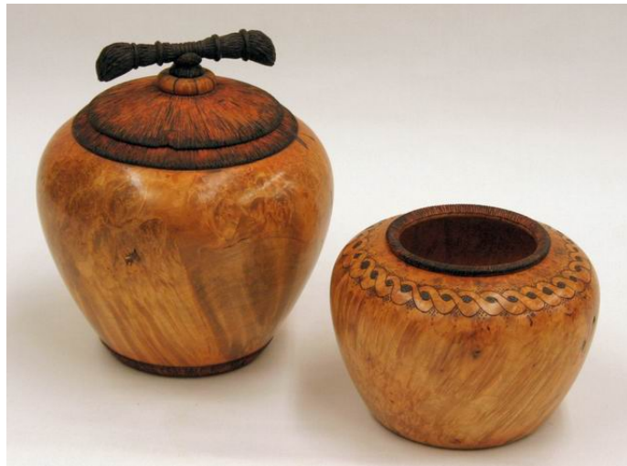
John Noffsinger, Burl hollowforms, Local maple 5 1/2 x 5 1/2 and 5 x 3