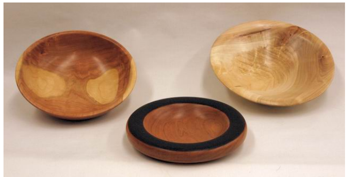
Jorge Salinas, Bowls - Cherry, Cherry, Silver Maple 7 1/2, 8 1/2 and 10 1/2