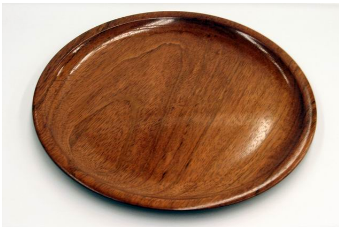
Aaron Grebeldinger , 10 1/2 Jatoba platter