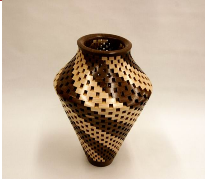
Bob Grudberg, TOP - Walnut & Maple Segmented vase 9 1/2; MIDDLE Walnut & Maple Segmented vase 8"