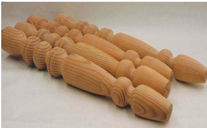
Greg Downs, Douglas Fir legs for craft table 27 x 3