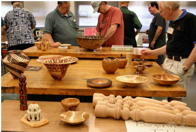
↑ The beginner's table →

This is a reminder that in order for your piece to appear in this section of the newsletter, at some point during the monthly meeting, you will need to bring your piece to Don for it to be photographed.