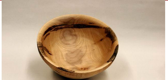
Ed Karch, 9 1/2 Maple Bowl; BOTTOM Maple bowl with mosaics