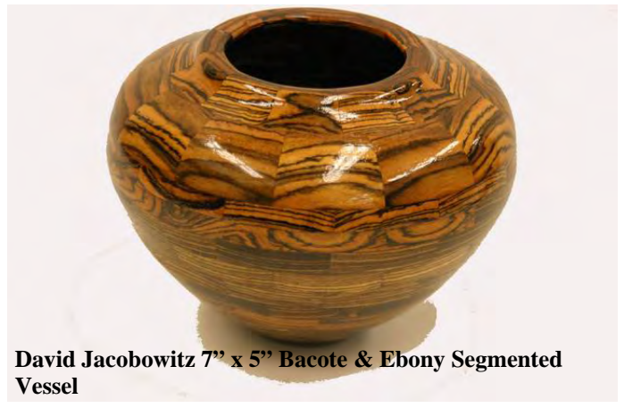
David Jacobowitz 7" x 5" Bacote & Ebony Segmented Vessel