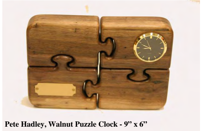
Pete Hadley, Walnut Puzzle Clock - 9" x 6"