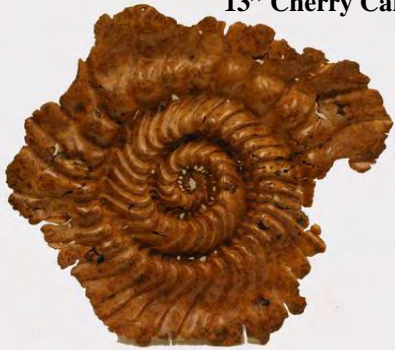
Neil Kagan, "Spiral Fossil" Maple Burl, & 13" Cherry Carved Plant Form