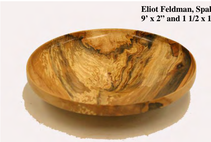
Eliot Feldman, Spalted Maple Crotch platter 9' x 2" and 1 1/2 x 12" Spalted Maple platter