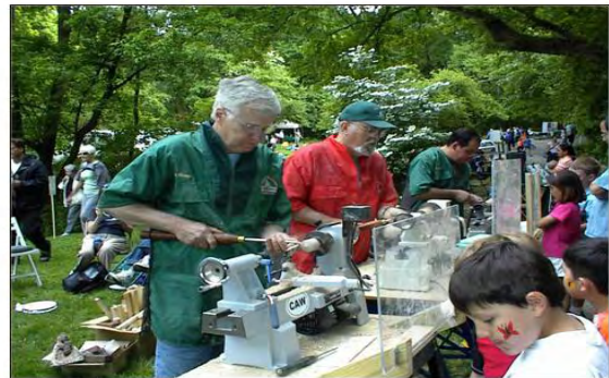
Potomac Overlook Park Demo