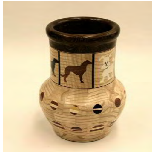
Leo Thibodeau, L to R - Southwest Segmented Form, Segmented sphere, "Animals"