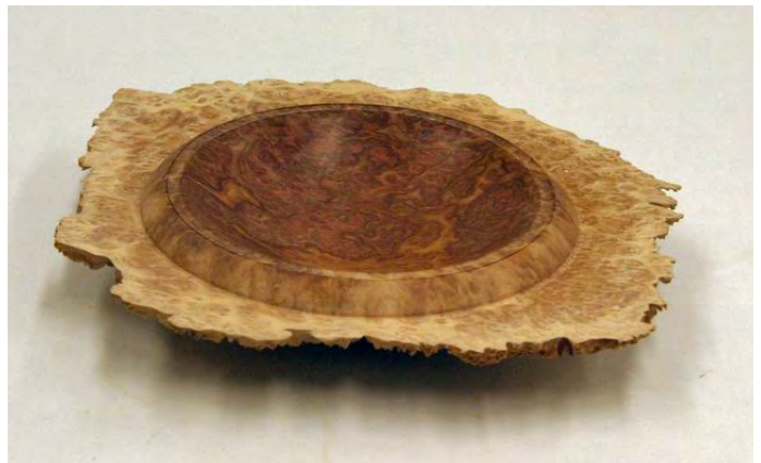
Drew Mitchum, 7 1/2 x 2" Red Mallee Burl Cap Bowl