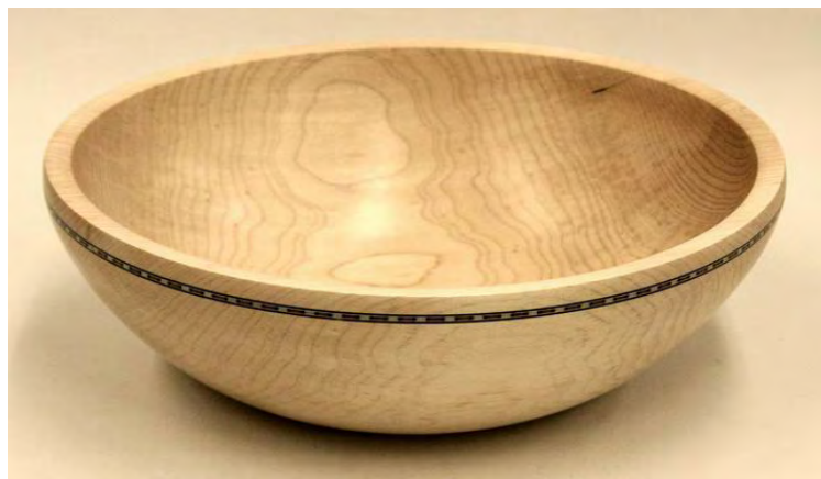
Pat Muller, 11" x 4" Maple with Inlay 9" x 6" Cherry Burl bowl →