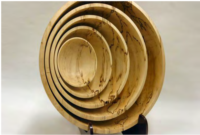
Alan Becker, Nested Box Elder Bowls, 12" x 6"

This is a reminder that in order for your piece to appear in this section of the newsletter, at some point during the monthly meeting, you will need to bring your piece to Don so it can be photographed.