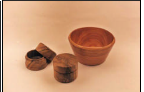
Above Left: Ed Moore - a 7"H goblet and a 3"H x 3"W hollow form made from Afzelia Xylocarpa Burl - a highly prized mahogany-like wood from Southeast Asia and particularly, Vietnam. Common names are Markar , Mahka , and Beng ( BENG may be just a generic word for wood). Finished with Mylands friction finish. Above Center: Lynda Smith-Bugge - 3"H x 6"W boxwood natural edge on a stone. Above right: Ken Darr - 4"W x 2"H Canary Wood bowl and two lidded pill-boxes of French Walnut.