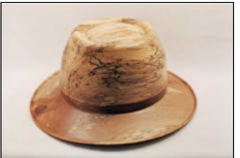
Above left: Don Hart – in the middle foreground (look close) – miniature goblets with loose rings on the stem. A 10”W Maple bowl , a 7”W x 1 ½”H Mahogany and an Oak 4”W x 1”H ring bowl Above Center and Right: Chris Light – 6”H and 12”W dyed Pecan bowl and a 8”Long Maple Spatula and an 11”W x 7”H Spalted Black Birch hat.