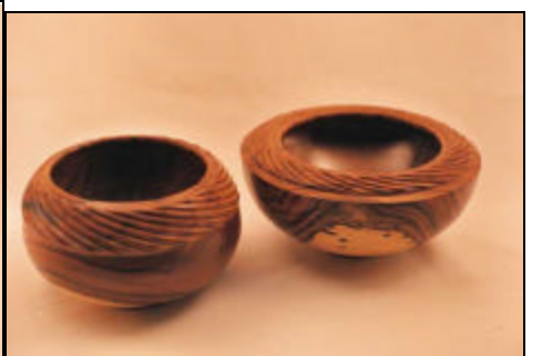
Above left: John Overman - 8"W x 2"H Cherry bowl and a 6"H x 2 1/2"W lidded box of Peach and Cherry. Above Center: Dean Swagert - a 8"H Madrone pitcher, a 5"H bowl of Plum wood cross-sections imbedded in black epoxy, and a 6"H x 5"W Madrone hollow form. Above Right: Art Jenson - two 4"H x 6"W Ironwood from Arizona pieces with textured rims.