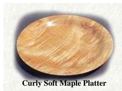
Curly Soft Maple Platter