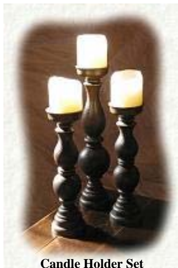
Candle Holder Set