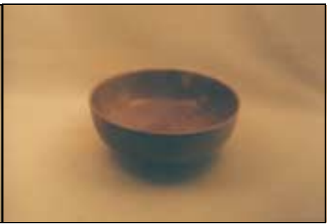
Left: C. A. Savoy – a diamond edge shaped bowl, 9” corner to corner from mahogany and a Cherry bowl with a burnt edge. Center: Dean Swagert – a 6”L X 3”W Crabapple elongated bowl. Right Bob Pezold – A 6” Sycamore bowl