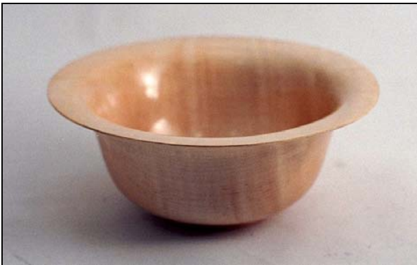
Left: Amy Rothberg - a very light Maple bowl of 6"W X 5"H