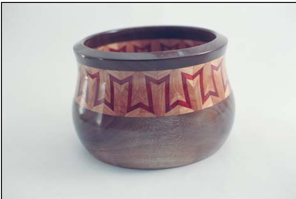
Left: Gene Crosby - a 10"W X 5"H Walnut bowl with Cherry inlay and a Paduak strip