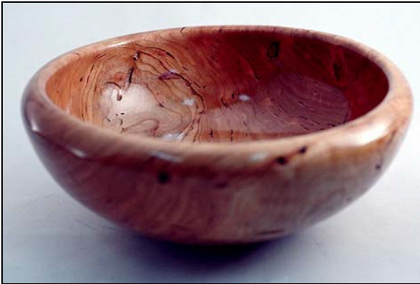
Left: Bob Reynolds - one of four Cherry bowls, each finished with a different product and using different techniques