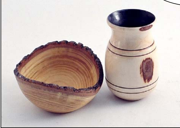
Left: Joyce Beene – a 3' X 2" natural-edge Mulberry bowl and 4" h X 2"W Maple vase