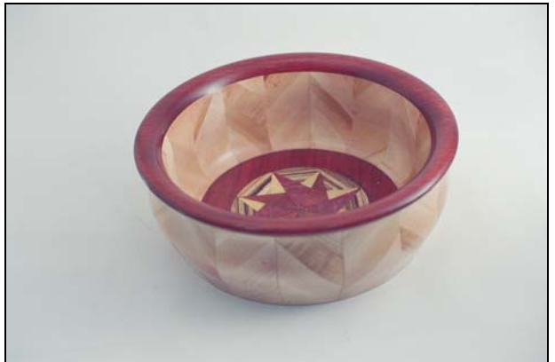
Right: Gene Crosby - a 10"W X 6"H segmented bowl from Maple with Paduak Rim and patterned bottom