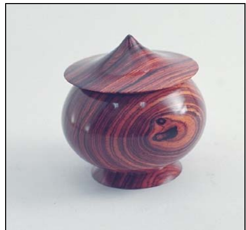
Right: Mike McInerney - a 3"W Cocobolo lidded box with a tight vacuum fit