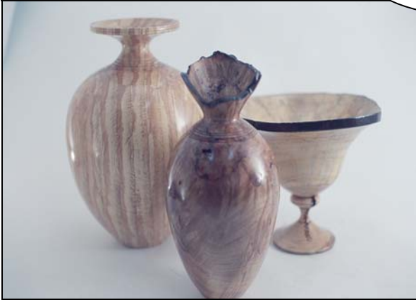
Left: - two 8"H hollow forms made from Pin Oak and Maple and a Spalted Maple natural-edge vase in the Jimmy Clewes style