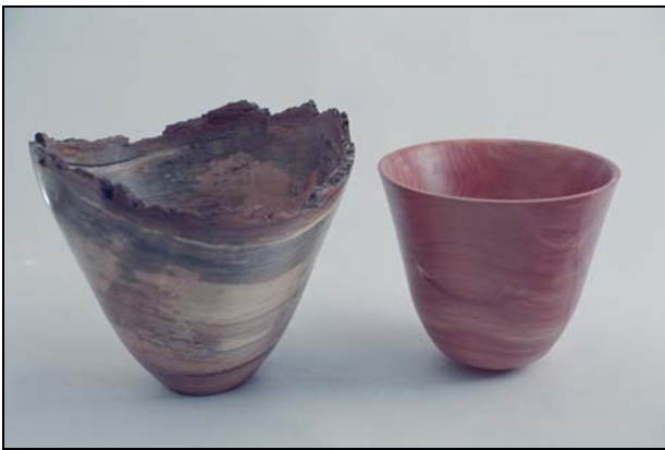
Left: Bob Grudberg – a 7"W X 6"H natural-edge Spalted Maple vase and a Cedar 9' X 5" vase