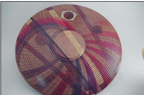
Left: Richard Allen - The back of a 18"W segmented platter