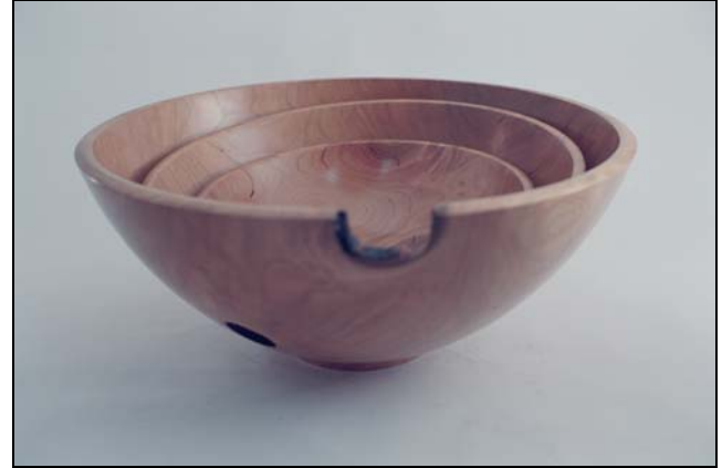
Right: Tom Boley – Three nested Cherry bowls (13"W to 8"W) from the same log H Mesquite