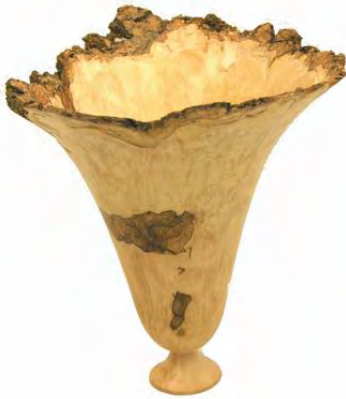
Bob Crawford, Chalice of Box Elder 8 x 5 Mesquite Hollow form 5 x 4

This is a reminder that in order for your piece to appear in this section of the newsletter, at some point during the monthly meeting, you will need to bring your piece to Don so it can be photographed.