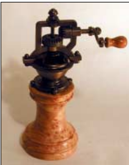
Left Bob Pezold - a Birdseye Maple pepper mill