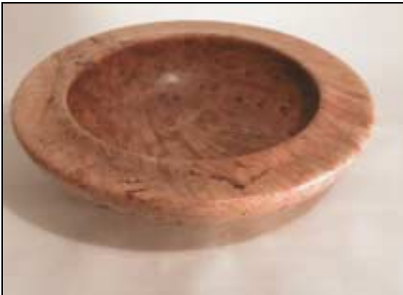
Left Steve Bishop - A spalted Curly Maple bowl, 10" w x 3 1/2" H