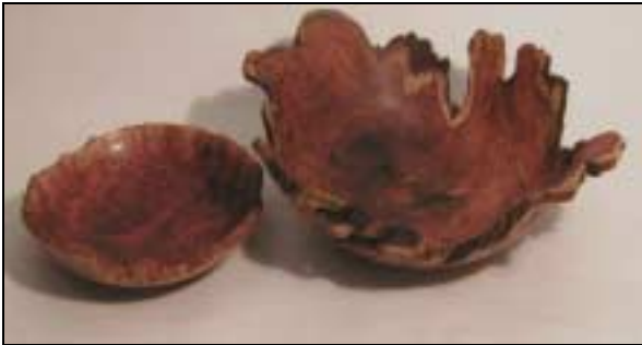
Left: Don Johnson - 13"W x 6"H end grain natural edge Mesquite bowl and a 7"W x 2"H Colabah burl bowl