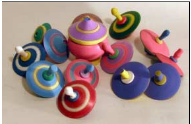
Right: Unknown. Lots of tops and a lidded box. They sure are colorful and make a pretty picture!