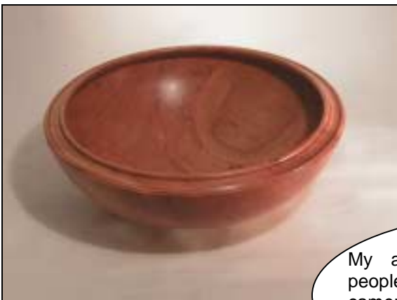
Left: Jim Marstall - a 13"W x 7"H Cherry salad bowl