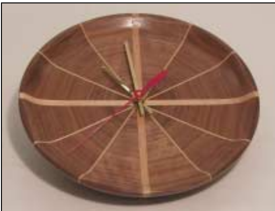
Left: Scott Wallis – 8 ½” x 1 ½” Walnut segmented clock face with maple sticks