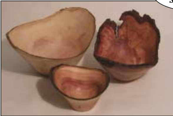
Left: Bob Grudberg - three natural edged bowls of 10"W x 6"H (Maple); 6"W x 4"H (Maple); and 3"W x 2"H (Cherry)