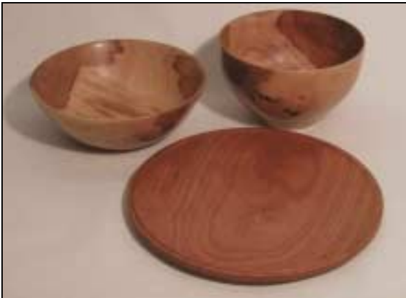
Left: Peter Walsh - 2 Apple bowls of 7" and 6" Wide and a 8"W Cherry Platter