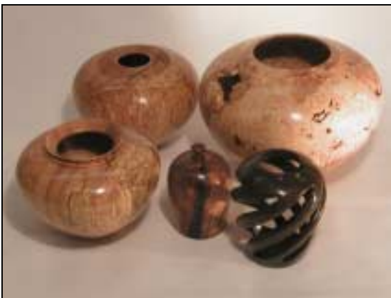
Left: John Trant - 5 pieces spalted Maple and died Ash