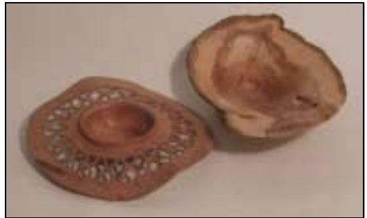
Right: Dean Swagert - 7"W natural edge biased Apple bowl and a 7"W pierced rim Madrone bowl