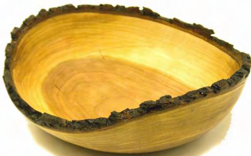
Annie Simpson, Black Cherry 18 x 12" bowl