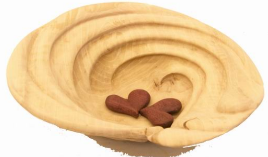
Neil Kegan, pear wood with bloodwood hearts carved bowl