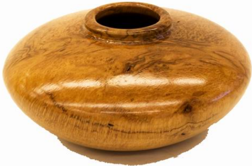
David Jacobowitz, 7 x 3 1/2 yellow box burl hollow form