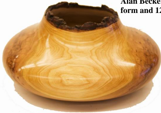
Alan Becker, 12" maple Southwestern form and 12" cherry hollow form

This is a reminder that in order for your piece to appear in this section of the newsletter, at some point during the monthly meeting, you will need to bring your piece to Don so it can be photographed.