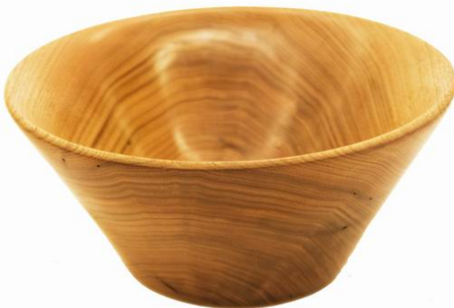
Paul Jackson, 7 x 4" butternut bowl