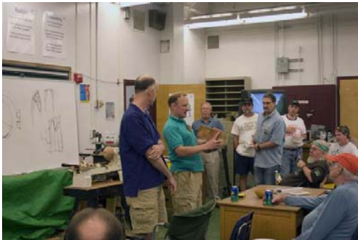
WOOD AUCTION ACTION