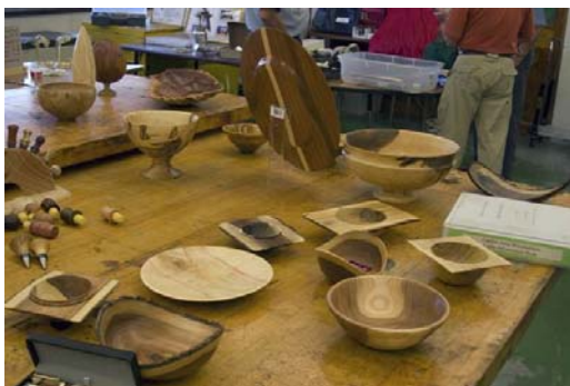
SHOW AND TELL TABLE