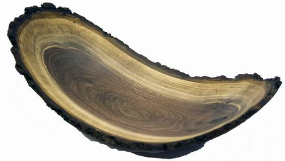
Dale Bright, 10" x 6" natural edge walnut bowl