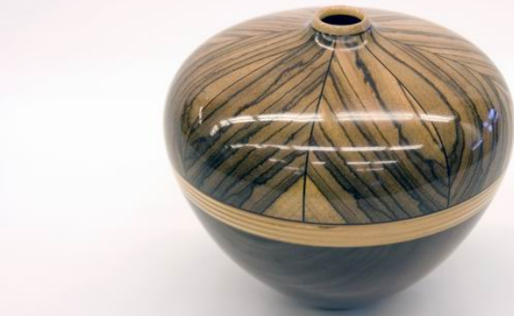
Alan Becker, 6" x 6" segmented zebrawood and walnut

This is a reminder that in order for your piece to appear in this section of the newsletter, at some point during the monthly meeting, you will need to bring your piece to Don so it can be photographed.