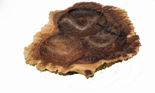
Dean Swagert, multi-center red mallee bowl 12" dia.